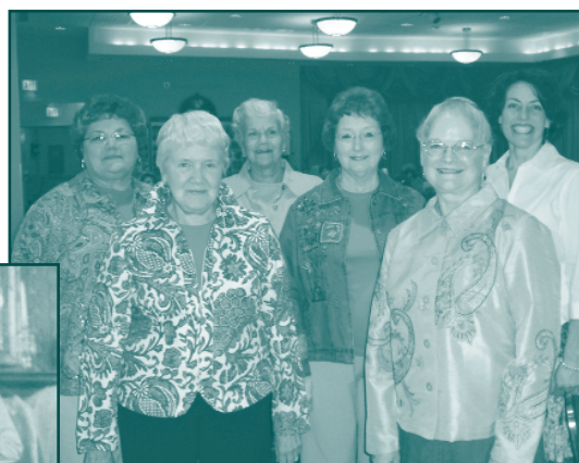
Photo to the left is from the early years of the Guild. Above photo is of a recent Guild Fashion Show.

Sensor lights on elevators Electric automatic doors in lobby Tree of Life Parallel exercise bar and treadmill Name plates for Health Center rooms Tables and chairs for Health Center Lounge furniture for Health Center Gifts to the Charitable Care Fund Smoke detectors for residents' rooms Camcorder equipment Sound System for Special Care Assisted Living curio cabinet Wool covered Geri-chairs Bedside tables Ground beautification Portable scales for Assisted Living Exercise equipment for Independent Living Large screen TV for Health Center activities DVD/Video players for Health Center BiFolkal Kits for Activity Department Park benches Wicker furniture for the ravine patio area Picnic tables with permanent grill