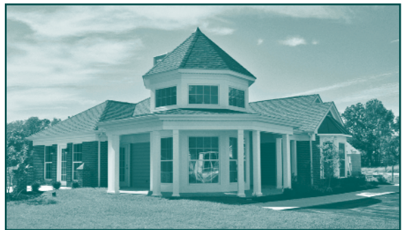
On the left is the beautiful country setting purchased in 2001 for the future Sanctuary at Wesley Hills. The Community Building is pictured above, and is available for residents' enjoyment with fitness room, game room and full kitchen.