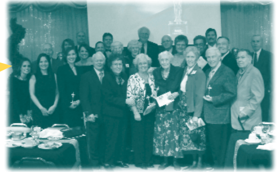
Photo of many of the stars that were honored at Wesley Glen's 40th Anniversary Celebration in December of 2009.

Wesley Glen celebrated its 40th anniversary of the first resident moving into Wesley Glen throughout 2009. The culmination of the events was a Celebration of 40 Years of Excellence and many of Wesley Glen's stars were recognized with an "Oscar" Night Celebration.